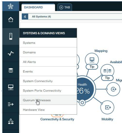
Figure 2. Navigating to Quorum Witness form in IBM Hyper-Scale Manager

to your application requirements. For the description of the IBM Hyper-Scale Manager operation, refer to its user guide.