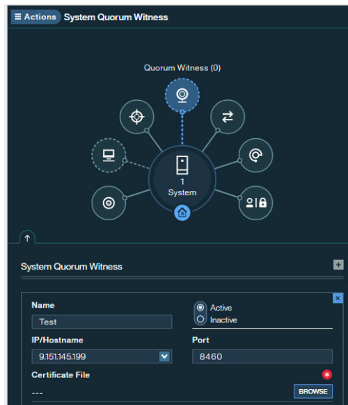
Figure 3. Quorum Witness form in IBM Hyper-Scale Manager